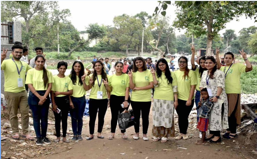
ENTHUSIASTIC TEAM OF SHUDDHI